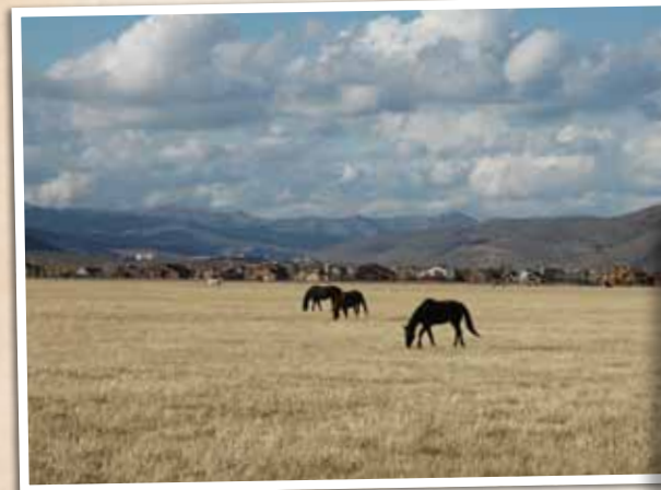
RED PINE LAND AND LIVESTOCK Park City, Utah

2011 Leopold Conservation Award Recipient || UTAH