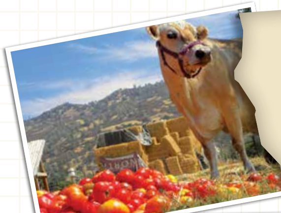
★ FULL BELLY FARM Sacramento, California