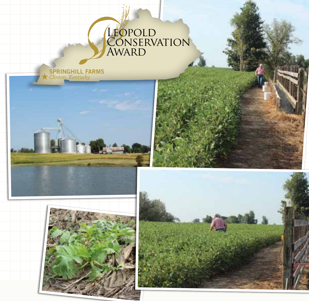
★ SPRINGHILL FARMS Clinton, Kentucky